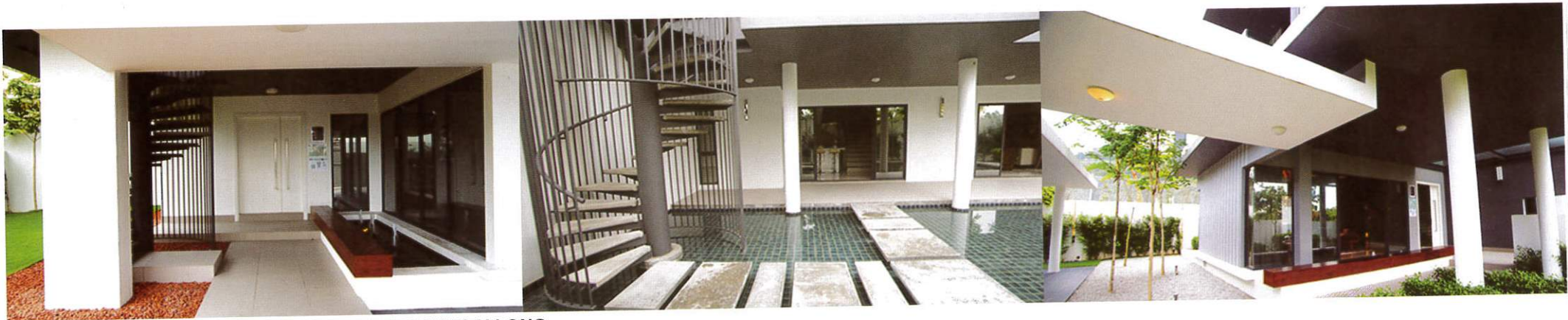
SERIES OF FOLDING HOUSE, TWIN PALMS SUNGAI LONG