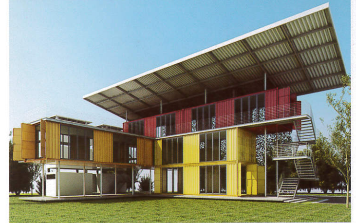
GREEN BIN AUTISM, GREEN SCHOOL SEPUTEH